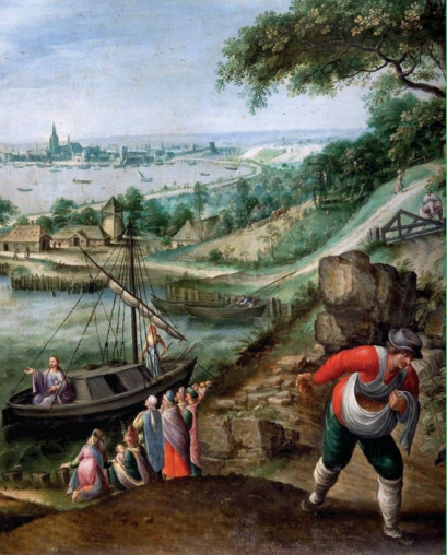
Excerpts from the Lectionary for Mass ©2001, 1998, 1970 CCD.

"The seed sown on rich soil is the one who hears the word and understands it, who indeed bears fruit and yields a hundred or sixty or thirtyfold." - Mt 13:23